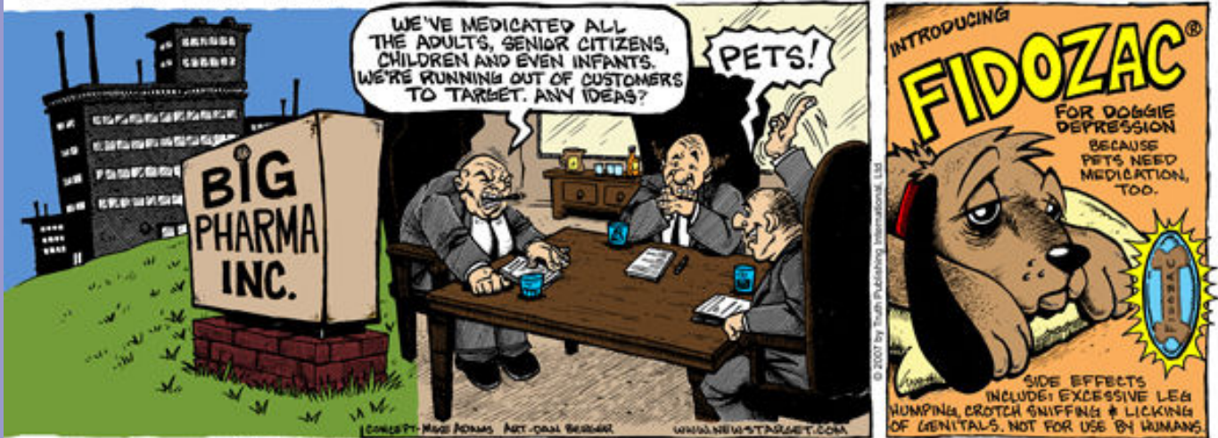
IN FEBRUARY, 2007, THE FDA APPROVED PROZAC FOR USE ON DOGS.